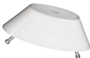
Plastic Whip Drive