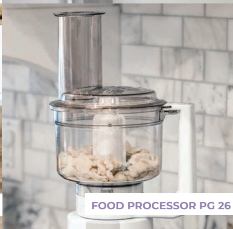
FOOD PROCESSOR PG 26