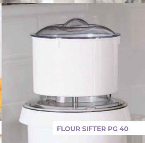
FLOUR SIFTER PG 40