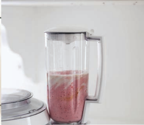
BLENDER PG 24