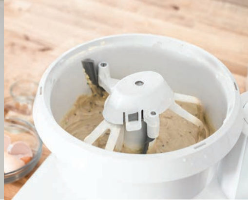
BOWL SCRAPER PG 41