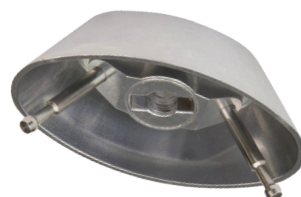
Metal Whip Drive