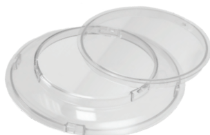
Splash Ring & Lid