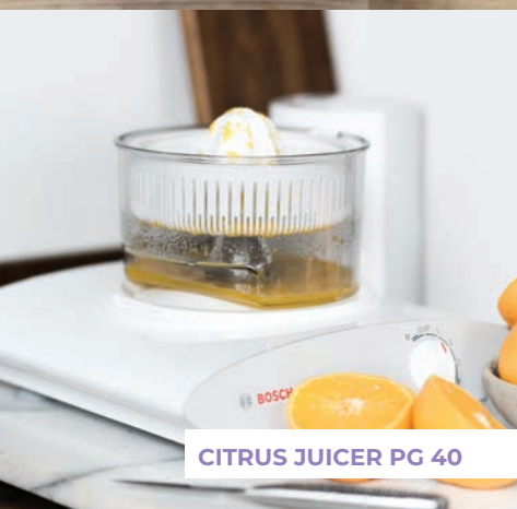
CITRUS JUICER PG 40