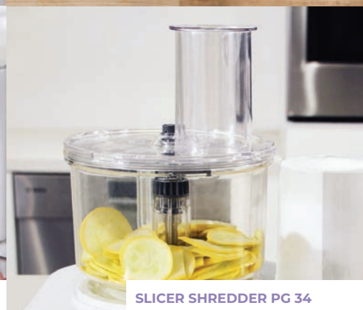
SLICER SHREDDER PG 34