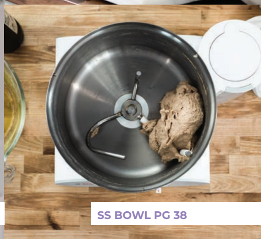
SS BOWL PG 38