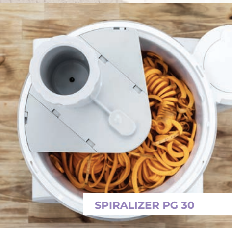
SPIRALIZER PG 30