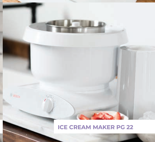
ICE CREAM MAKER PG 22