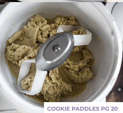
COOKIE PADDLES PG 20