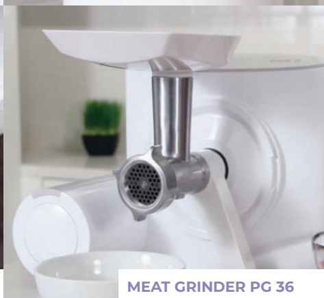
MEAT GRINDER PG 36