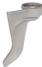
Dough Hook Extender