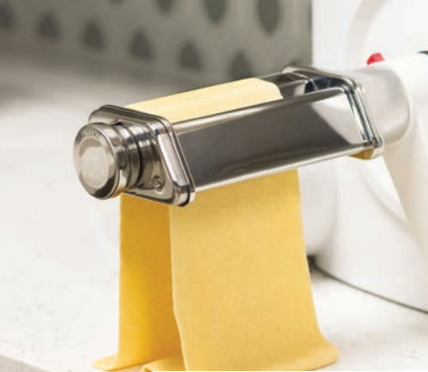
PASTA MAKER PG 28